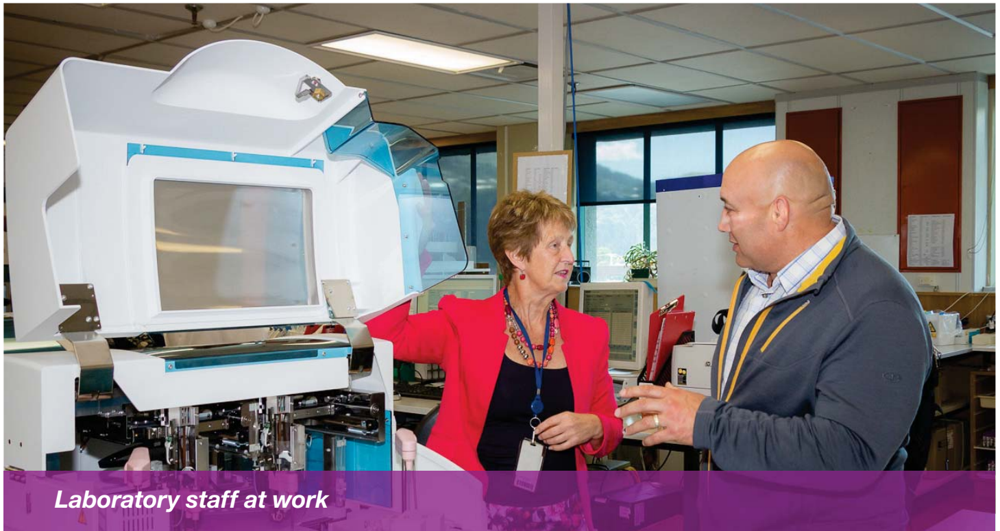
Laboratory staff at work