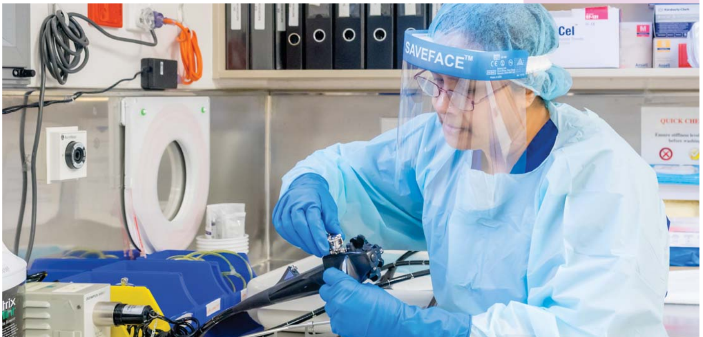
Centralised sterile supplies department